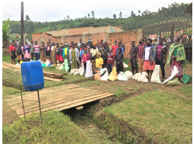
Orphans and guardians receive food

MukoHOPE served an average of 126 orphans in 2020. Twenty of our MukoHOPE orphans were enrolled in vocational schools. All students were interrupted with the COVID lockdown beginning in March. A few girls were “launched” (moved out of the ACT program with our blessing) because of decisions to marry or pregnancy, a national trend during the lockdown. We learned in April that our orphans’ guardians and their families were hungry because their children were all home from closed boarding schools and they were unable to go out to shop for staple foods or sell their crops. Our orphan sponsors graciously agreed to have their sponsor funds used to provide food for the families. The families received millet flour, rice, salt, sugar, posho (corn meal) and beans. These distributions were made in May and August. Remaining funds were used to support Muko High School as all schools struggled to remain solvent during the pandemic. We were unable to run the Gift Buying program this year as staff could not shop for or distribute gifts during the pandemic. The MukoHOPE team worked over Zoom on a new plan for our orphan support and student scholarships. These changes will be forthcoming in 2021.