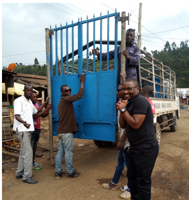
New blue windows for Muko High School

School building improvements: Through a grant from St John's Episcopal Church Endowment Committee, in Midland, Michigan, work continued on the high school's security fencing, windows and doors. Windows and doors were finally completed in November with other work gearing up in December. As a preliminary step towards the general construction of a security fence around Muko High School, strong metallic shutters were installed at the exterior part of the high school. These shutters replaced the old wooden doors and windows on the exterior side. Under this arrangement, a total of 62 metallic windows with burglar-proof locks, three metallic doors, and a strong wide gate at the exit from the school's main campus were installed.