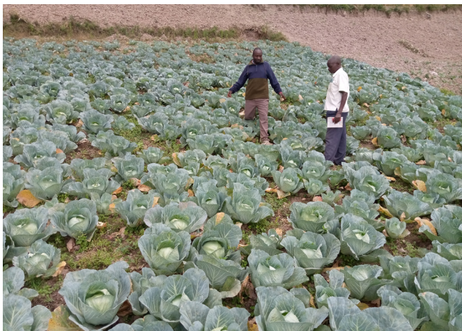
Cabbage crop with Tito and Tom

HEAL began its fifth year of regular community dialogues with great success until March 2020, when program activities were halted due to pandemic lockdown measures. COVID-19's societal impact has been devastating for Uganda. In addition to widespread cases of COVID-19, months of strict government lockdown measures have led to massive setbacks in agriculture, education, and access to healthcare for other deadly diseases like HIV and malaria. Because of the rural setting of Muko Sub-County and strict lockdown rules, travel or outreach for HEAL has become exceptionally difficult, especially among remote communities.