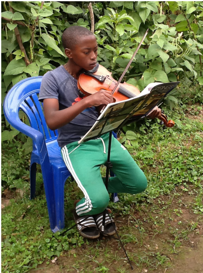
A student practices violin