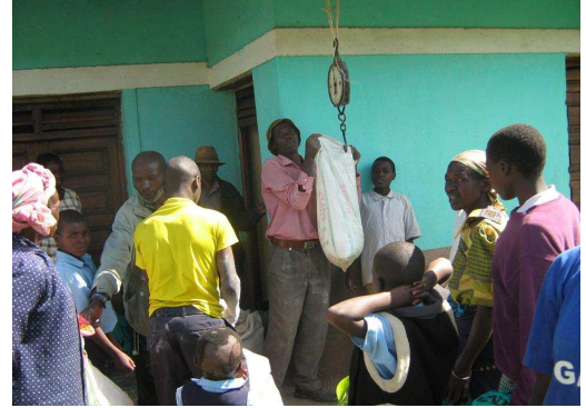
Weighing food for distribution.

The recent items purchased for the children included casual wear such as shoes, stockings, trousers, shirts, and dresses. They also received food, soap and new mattresses and blankets for any orphans who had not received them previously. Since the goats have been so successful, it was decided to also give the children hens to raise. These birds are hoped to "instill in them a good spirit of farming and get eggs for their good health."