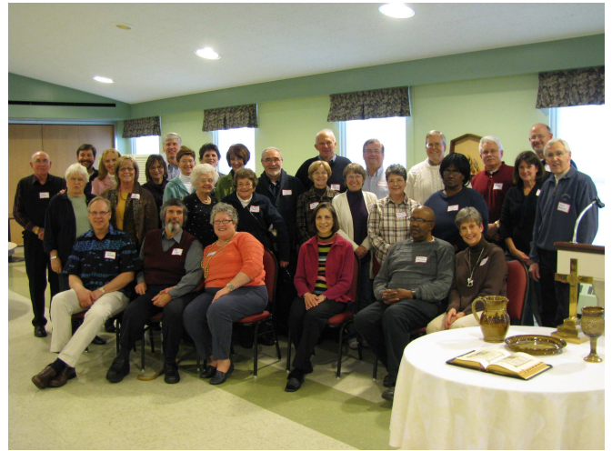
ACT-Michigan Muko-HOPE Sponsors