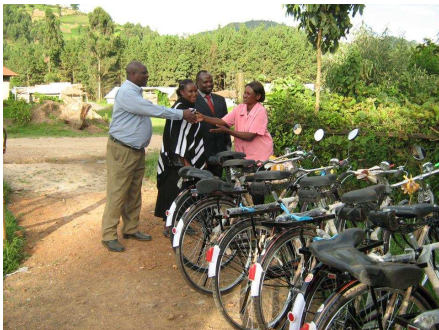
Volunteers receiving new bicycles – one for each of the seven parishes.

The much awaited motorcycle and bicycles have finally arrived in Muko and it is believed that the new forms of transportation will allow each orphan to be visited every month! The children were found to be happy and the goats looked healthier. The volunteers expressed their vote of thanks to our friends for answering their long awaited idea of being given transport means. We are grateful to our sponsors for their continued commitment to the pledges they have made and look forward to more fruitful co-operation and working as a team!