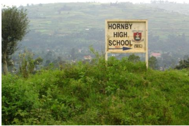
Hornby High School