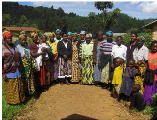
MEP workers in Muko