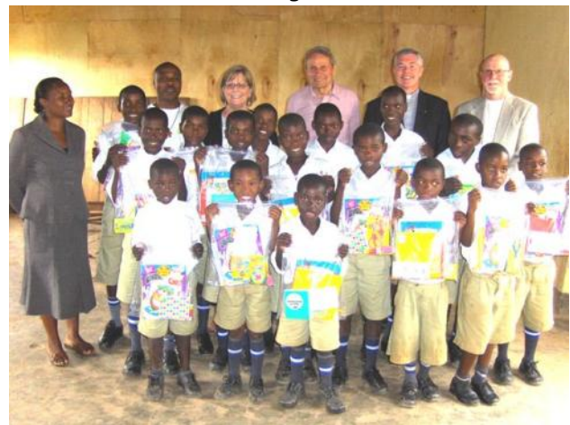
Muko HOPE Boys in Primary School