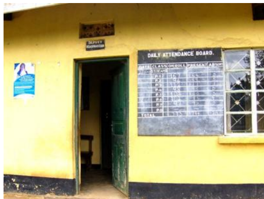
Entrance to Boys School