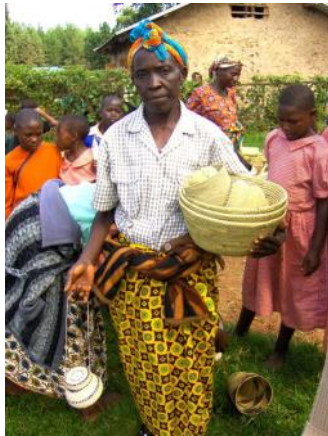
Muko basket maker

During the mission team visit, the women learned the concept of quilting. The women in the villages will be sewing colorful blocks of African fabrics which will then be completed into quilted items by the Midland-based sewing group. We are all excited about this "bega hibega" (Rukiga for shoulder-to-shoulder) project where the two groups of women in Michigan and Muko are dependent upon the other!