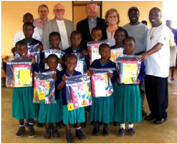
Muko HOPE Girls in Primary School