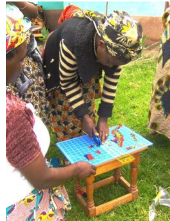
Learning the use of cutting tools for fabrics