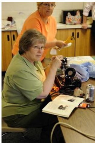
Midland women sewing